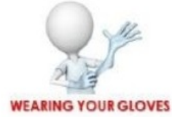
WEARING YOUR GLOVES