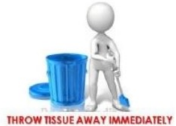
THROW TISSUE AWAY IMMEDIATELY