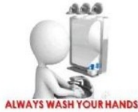
ALWAYS WASH YOUR HANDS