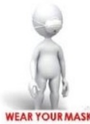
WEAR YOUR MASK