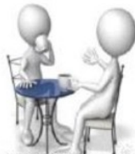
CLOSE CONTACT WITH OTHERS