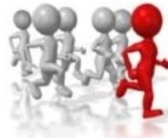
GATHERING OF OVER 50 PEOPLE

COVID-19 PANDEMIC: STAYING SAFE...STAYING HEALTHY...SAVING LIVES