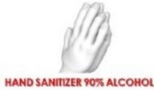
HAND SANITIZER 90% ALCOHOL